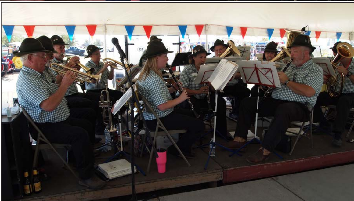
The Praha Brothers Band and the Round Top Brass Band entertained throughout the day. Various food and activity booths dotted the grounds. Antique cars and tractors held everyone's attention. Demonstration booths and tours of the Czech Village buildings rounded out the day.

Heritage Fest