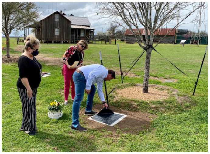
The Kruppa family unveils the plaque dedicated to their parents